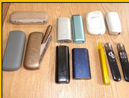
Electronic Cigarettes (Vapes)